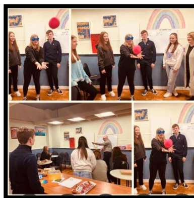
Y Zone fun in the Coffee Bar.