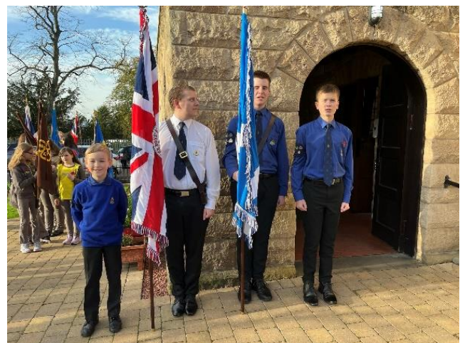
Boys' Brigade Colour Party on Remembrance Sunday